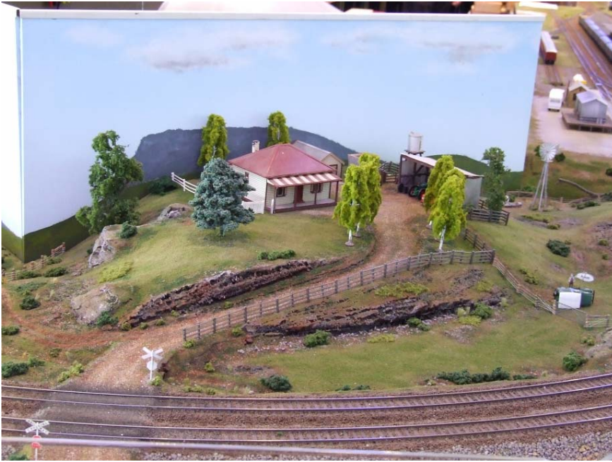
A cottage featured on 'Tybrook' the creek just in front of the cottage is another of the excellently modelled features.

By far the largest layout in the venue was 'Tybrook (Cardina Rail Link)' quite a massive HO layout, with some excellent bridge and tunnel scenes. On both viewing occasions the layout was running entirely Australian outline rolling stock, though we were told by the operators (and the exhibition guide) that it often ran with an entirely American outline.