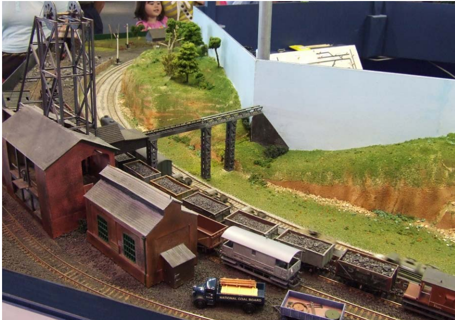
Midsomer Norton's coal mine, with fully laden coal train about to depart the yard.

'The Valley' , built by the Latrobe Valley MRA was another layout with an overhead wiring network. Having a much simpler track plan than that on the above layout enabled The Valley's catenary to be powered, faint sparks just the prototype could just be seen above the ambient lighting as breaks in contact occurred with the overhead line. The catenary and a combination of two and three rail track meant that just about any HO train could be run on the layout. The Valley also featured a coach and other vehicles that drove around a loop of roadway, safely stopping at level crossings if a train was approaching, then continuing on their journeys once the train had safely passed.