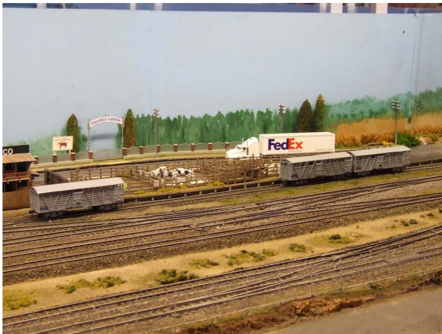
The cattle yards featured on 'Murri' an HO layout by the Victorian branch of AMRA.

The morning was spent slowly perusing everything in the venue, mentally noting layouts that needed to be photographed and contacts made for future NMRI exhibitions. We noted a few ideas that we could implement.