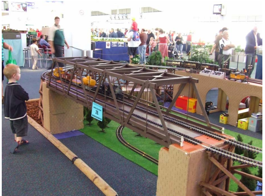
Some of the excellent, large scale bridges on The Gauge One Gallery’s display layout.

There appeared to be a nice balance between traders and layouts. Many of the usual traders were represented. ‘Train World’ and ‘Powerline’ , ‘Broad Gauge Models’ , ‘Team Alco’ , ‘EFD Simply Glues’ , and ‘Auran Trainz’ have become familiar faces at many exhibitions over the years. Others included ‘Australian Railroad Photography’ , ‘ARHS Victorian Division’ selling books, videos and other railway merchandise, ‘Running With Scissors’ had an interesting collection of sharp things – scalpels, blades, scribing probes as well as tweezers, forceps, and pliers all aimed at the modeller’s toolbox. ‘Iron Horse Hobbies’ , ‘Rail Motor Models’ , ‘Brunel Models’ , ‘Victorian Hobby Centre’ , ‘J & K Hobbies’ the manufacturers of TRACKRITE flexible underlay and ‘The Railfan Shop’ . ‘Narrow Gauge Down Under’ and ‘Motive Power’ each had a stand displaying their magazines. ‘Steam Era’ were teamed up with ‘Hollywood Foundry’ both of whom would know the NMRI club reasonably well. Likewise Peter Vincent and Norm Bray were in attendance demonstrating their ‘VR Rolling Stock’ website, on which a few NMRI members are known to spend too much time.