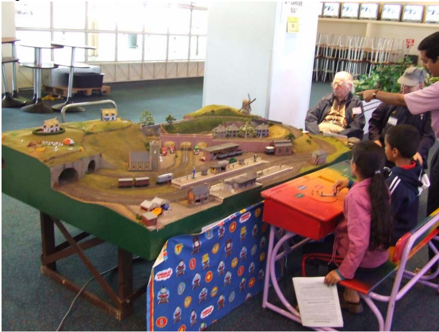
Children operating AMRA's 'U-DRIVE'