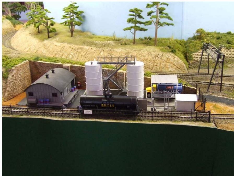
One of the many excellent scenes on Murri, this one featuring the oil storage facilities.

For the gauge one fans ‘The Gauge One Gallery’ was on hand selling just about everything a large scale modeller could want, including a large scale shay with a large scale price... Beside the retail outlet was a ‘compact’ 45mm gauge layout, which had a footprint bigger than most of the layouts in the show. Only an oval of track running about 2’ off the ground, the layout featured some massive trestle bridges and an excellent viaduct.