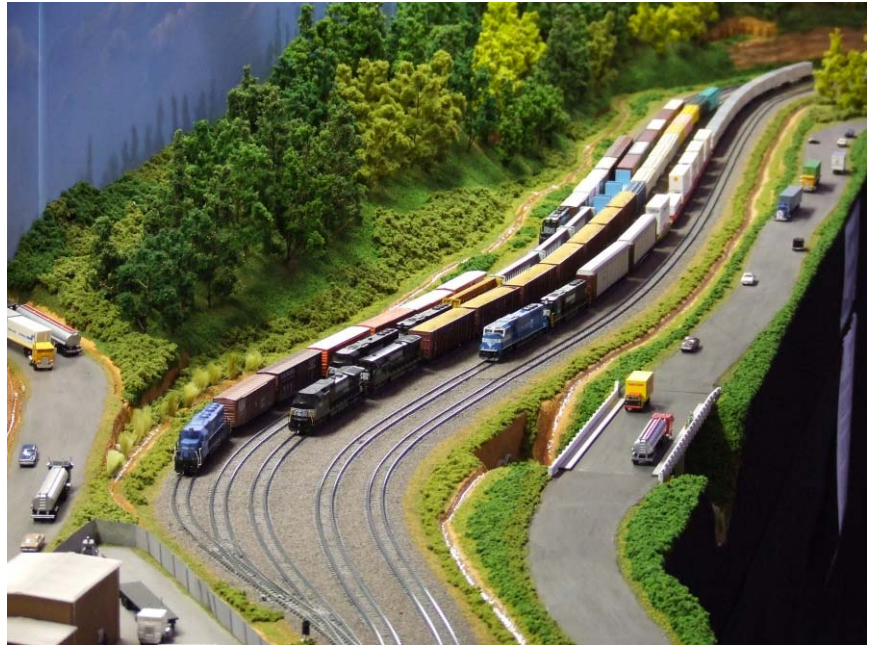
A large yard full of trains on 'Kentucky Division'.