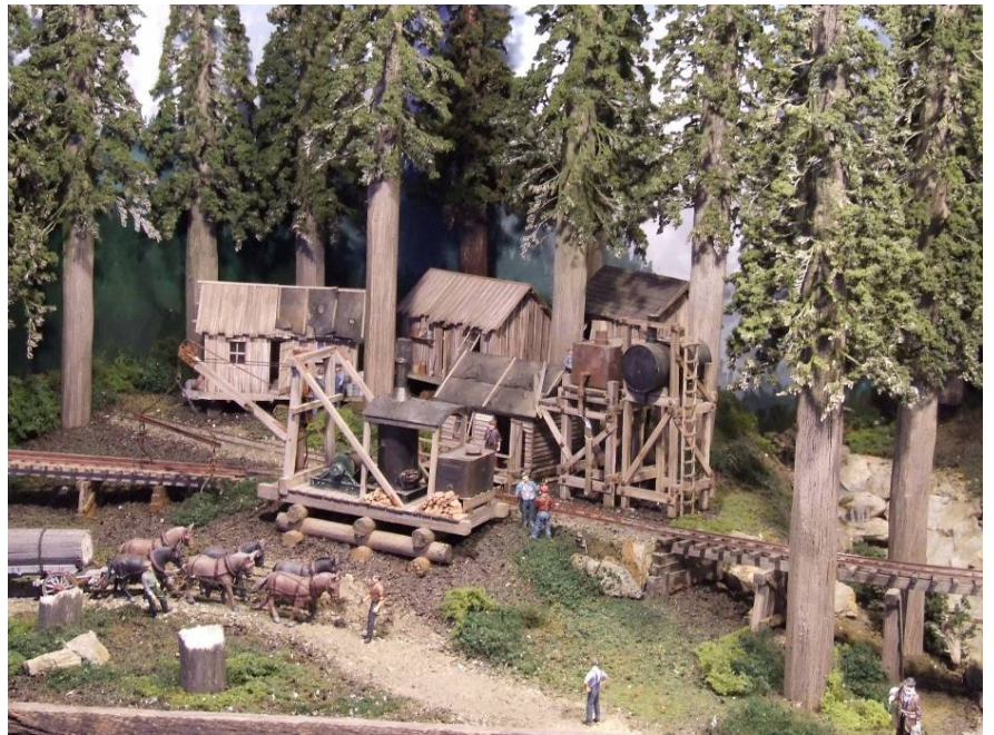
A depot scene modelled on 'Cannibal Creek'

'Cannibal Creek' and 'The Art of The Diorama' will be becoming increasingly familiar to the NMRI members especially as it was seen at the last NMRI exhibition in October 06. Once again demonstrations of diorama building, and scratch building in general could be seen, answers to questions on most aspects of modelling could be obtained.