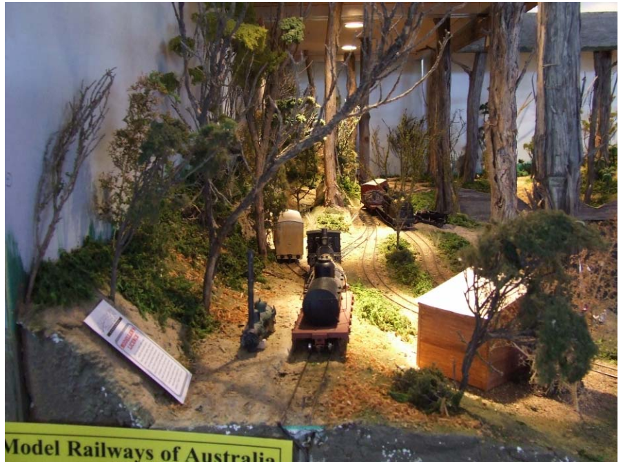
One of the small yards of 'The Victorian Hardwood Company', just one of the many features on this small On30 layout.

At the Sandown race track we were surprised to find entry fees of $5 for adults and $3 for children, we had been expecting to pay potentially double that. At the entrance it was surprising to learn that one of them men knew of NMRI.