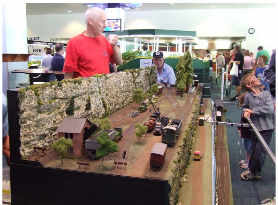
'Pierreville' – The cable car track is at the very front of the layout, right hand side of the photo.

'Hands on' layouts included 'Pierreville' depicting a typically French scene and modelled in dual gauge O and Oe. Pierreville had many entertaining things for youngsters to have a go at, in front of the layout children could set in motion a pair of cable cars climbing and descending a steep incline. On the layout, there was an operating coal loader, and once full the coal hopper had to be emptied, requiring a shunt movement to the coal dumping area via the turntable. By far the biggest attraction was the operating yard crane, using the operating yard crane it was possible to transfer loads between trucks, railway wagons and the platform, this certainly generated queues of children wanting to pick something up and shift it around.